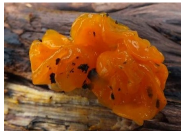
Yellow brain fungus